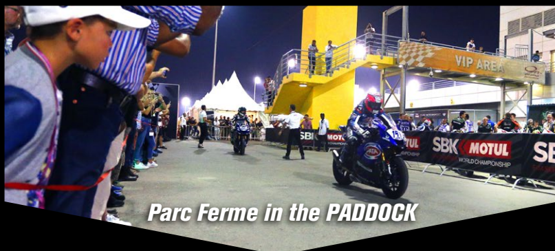
Parc Ferme in the PADDOCK