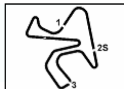
Jerez 4.423 m